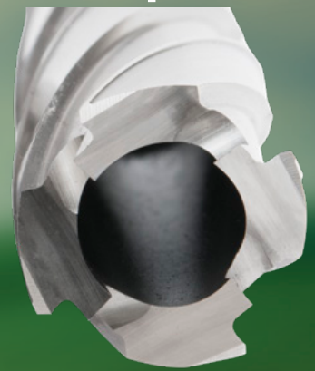
Re-sharpened cutter restored to factory geometry